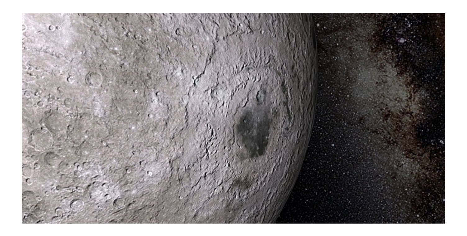
Download >>> <a href="http://bit.ly/2K0zHbe">http://bit.ly/2K0zHbe</a>

DOA6 Character: Nyotengu Activation Key Crack